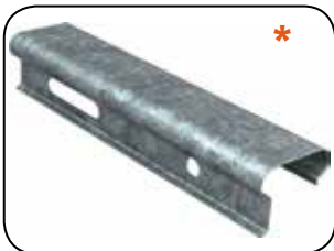
865 SEISMIC TCR JOINER

To see Rondo's new Seismic products in situ, visit www.rondo.com.au/seismic