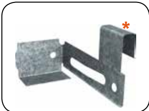
850 SEISMIC SLIDING CLIP