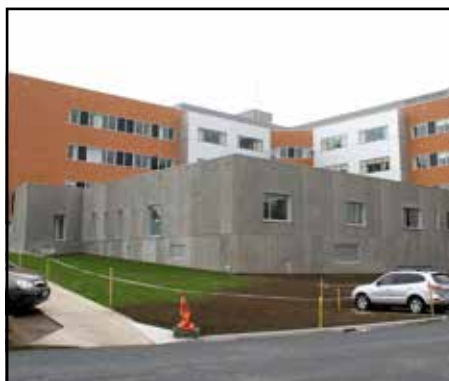
Taranaki Base Hospital