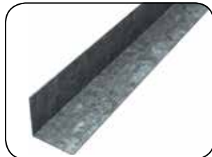
530 HEAVY DUTY ANGLE