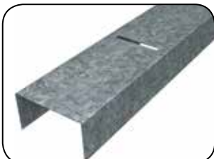
SEISMIC DEFLECTION HEAD TRACK