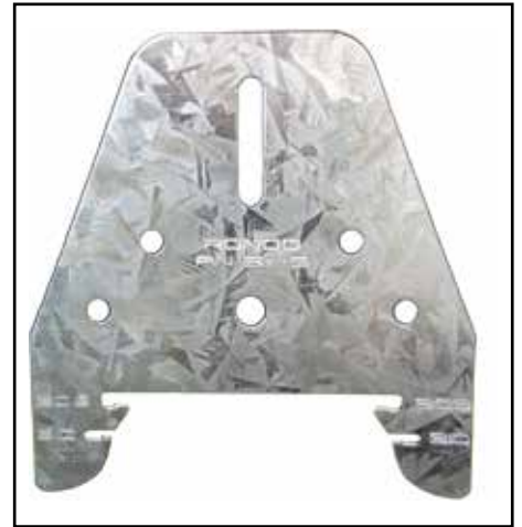
RONDO 311D DUAL DIRECT FIX CLIP

To view Rondo's latest products and download our Tech Briefs, visit www.rondo.com.au or alternatively, simply scan the QR code alongside.