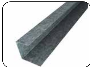
141 WALL TRACK